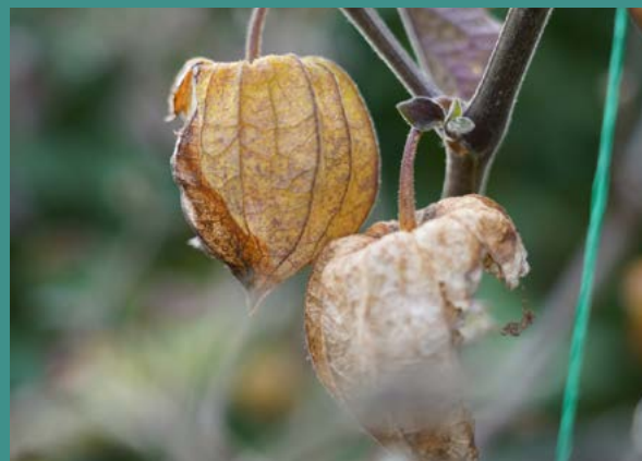
A goldenberry plant affected by mancha morada.

Mancha morada , also known as Punta Morada de la Papa (PMP) is a relatively recent plant disease that occurs in plants in the potato or Solanaceae family, which includes potato, tomato, peppers, ground cherries, eggplant, and tobacco. This disease has been detected around the world and has recently entered Ecuador starting with potatoes and tomate de árbol . The disease is caused by a phytoplasma, which is a bacteria without cell walls, that enter the plant through the vector of an insect called Bactericera cockerelli , which is commonly known in Ecuador as paratrioza . Once a plant has been infected, symptoms include yellow and curled leaves, and the appearance of purple spots, which gives the disease its common name of “purple stain” ( mancha morada ) or “purple tip” ( punta morada ) (Government of Ecuador, 2021).