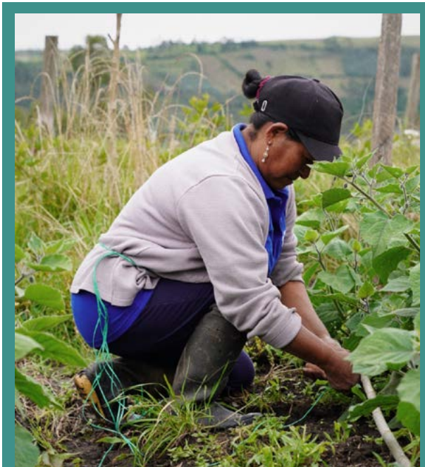
A member of the Ruta Escondida farmer association caring for her goldenberry plants.