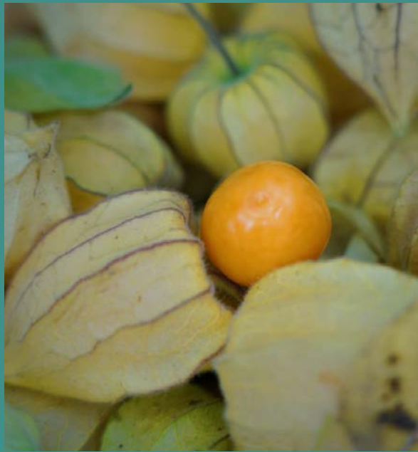
Goldenberry produced in Ecuador.