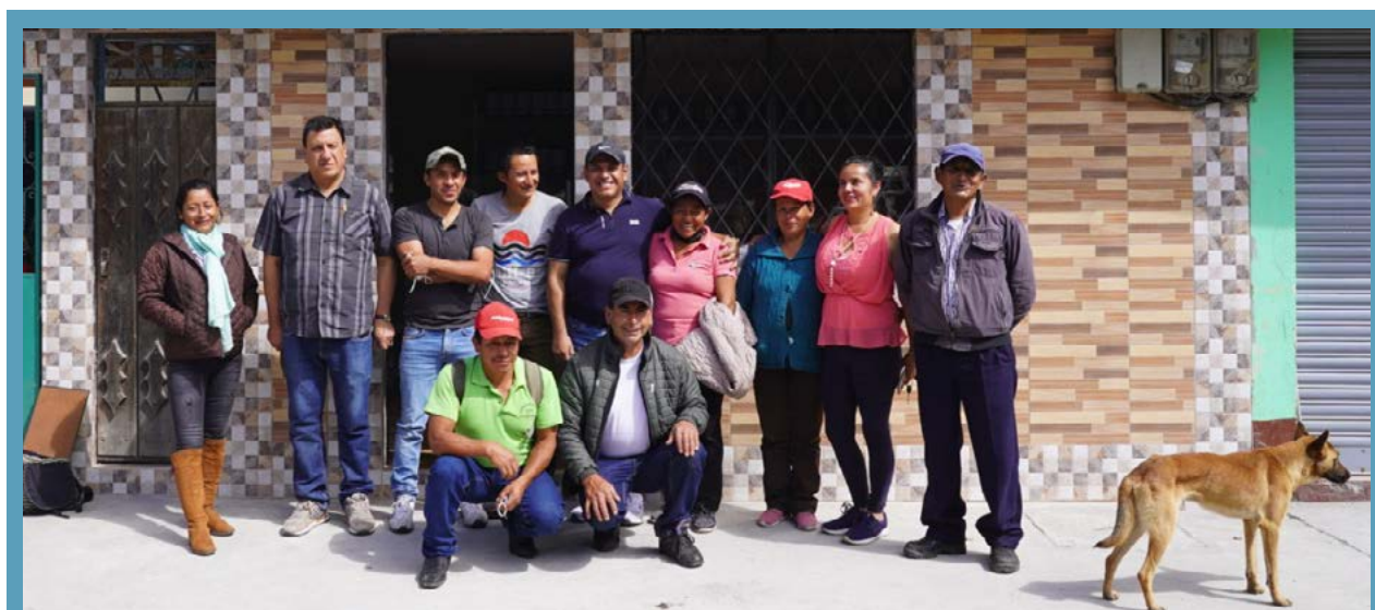
The group of Ruta Escondida farmers in charge of the new supply store for bio-inputs.

In addition to starting to produce their own liquid bio-fertilizers and insect repellents, farmers participating in the goldenberry work have started to experiment with generating their own sources of manure and other solid organic inputs for compost and fertilizer production. In Cuzubamba, farmers have started to raise their own guinea pigs, chickens, and cows to obtain the organic